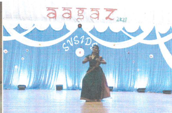
FRESHERS DAY CELEBRATIONS